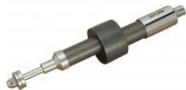
JE01.003 Oscillating Saw HandPiece