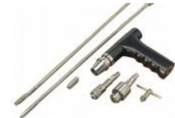
JE01.004 Reaming Handpiece With Max. Speed 400 Rpm Cannulated & Ao Type Quick Coupling