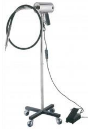
JE01.001 Driving Unit Includes Motor, Stand, Foot Control, Flexible Shaft, Tool Kit, And Oil Bottle & Special Container.