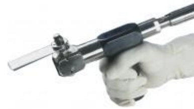
JE01.005 Sagittal Saw HandPiece