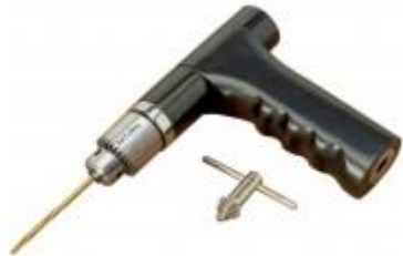
JE01.002 Cannulated Drill Handpiece Max. Speed 1200Rpm & With Fixed S.S. Chuck (0-1/4")